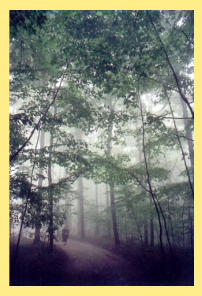
OF HAZRAT INAYAT KHAN